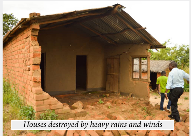
Houses destroyed by heavy rains and winds

Following the devastating cyclone Idai effects in areas where the Child Aid project is implementing, DAPP has been mobilising communities to construct permanent structures which include latrines to promote hygienic practices.